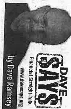
by Dave Ramsey www.daveramsey.org

better measure of what the market is doing, because it represents the stock-price activity of 500 companies.